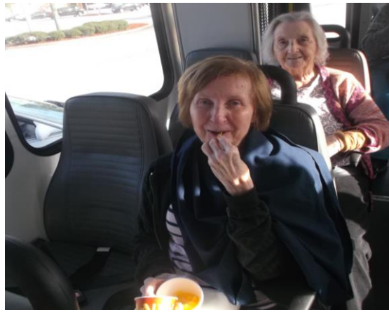
French Fries & Fun!