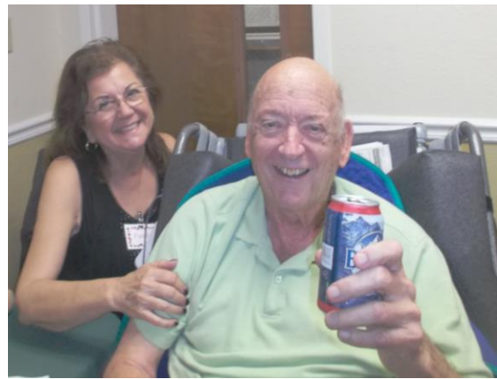
Enjoying Happy Hour!