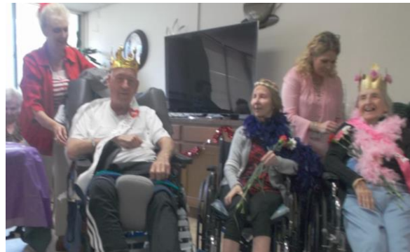
Valentine's Day King, Queen & Princess.