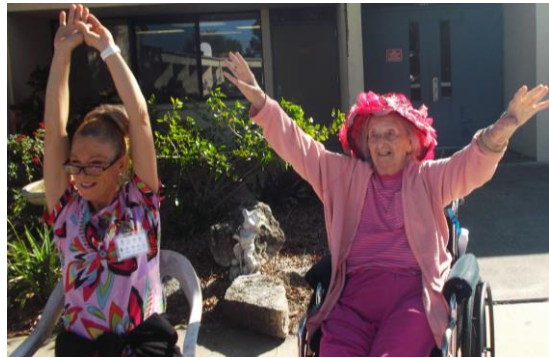
Exercising in style!