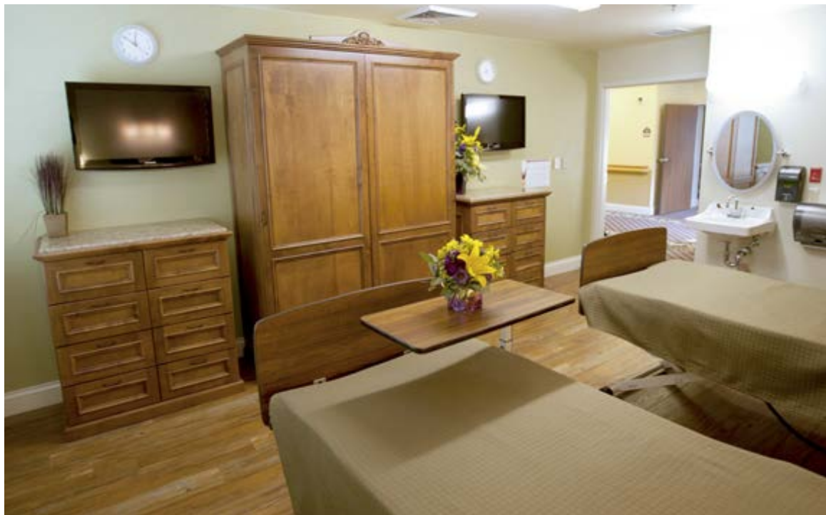
Spacious Private and Semi-Private Suites