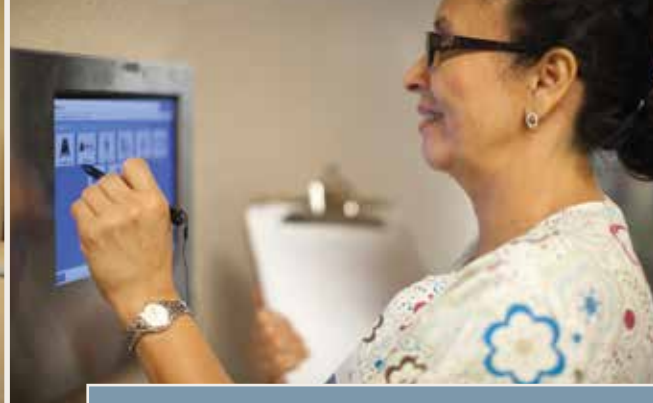
24-Hour Nursing Care