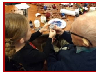
Decorating ornaments together for Our Heroes' Tree